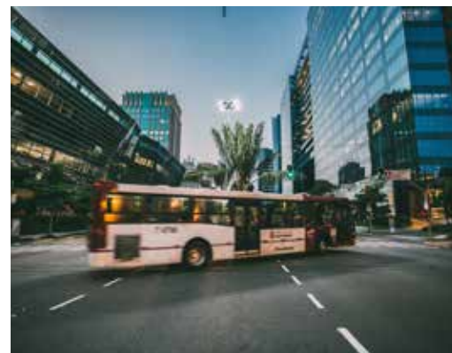
Transport and conveyance