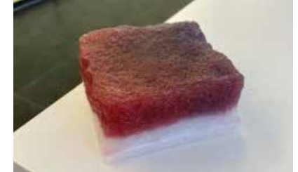
Project: LED paving stone

Benefit: Very high transparency due to high transmission values