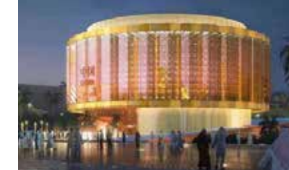
Project: Flexible LED curtain for EXPO 2020

Benefit: Material also available in cartridges