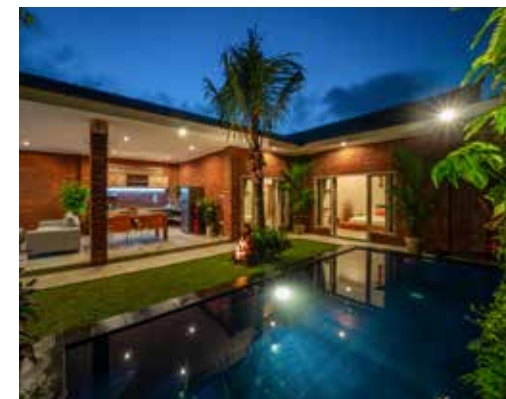
Use at home