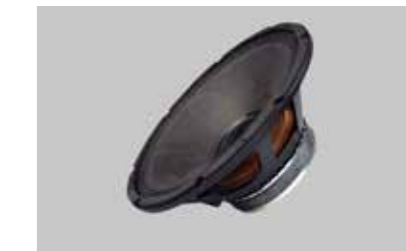
Project: Bonding of rubber gasket

Benefit: 30 % gain in time by fast strength build-up after pot life