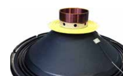
Project: Bonding of damping with voice coil and membrane

Benefit: Mixing ratio 1:1 - safe for automatic dosing