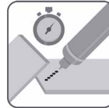
Structural bonding with media resistance