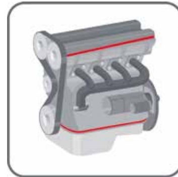
Bonding and sealing of pipe threads