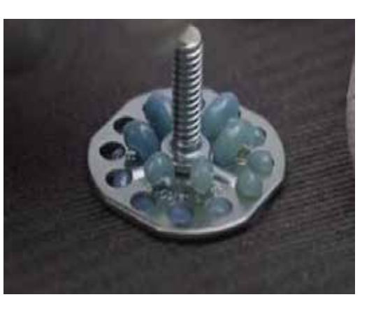
Composite & Metal

black, pasty high temperature resistance, impact resistant, EN45545-2 approved