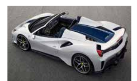
Project: Sports car - visible exterior part (CFRP-CFRP)

Benefit: Long open time for correct alignment (shaft-club head)