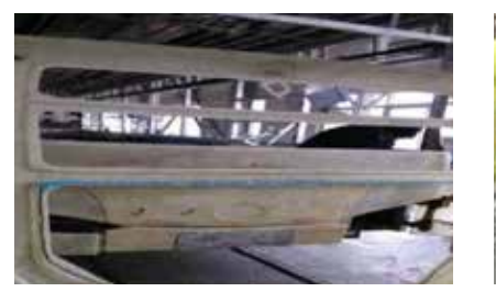
Project: Bus - Bonding of Front End Module (GFRP-Metal)