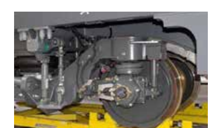
Project: Thread Locker