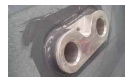
Project: Cable bushing (GFRP-Metal)

Benefit: Very low odour during processing